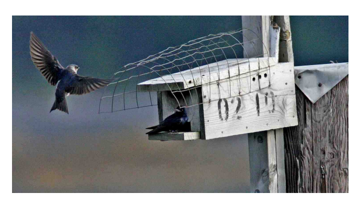
Purple Martins @ LMS marina