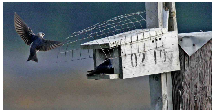
Purple Martins @ LMS marina